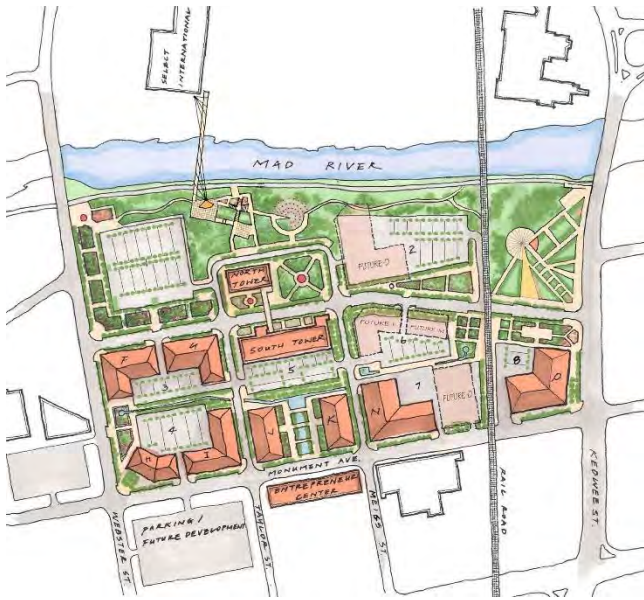
Tech Town Conceptual Design