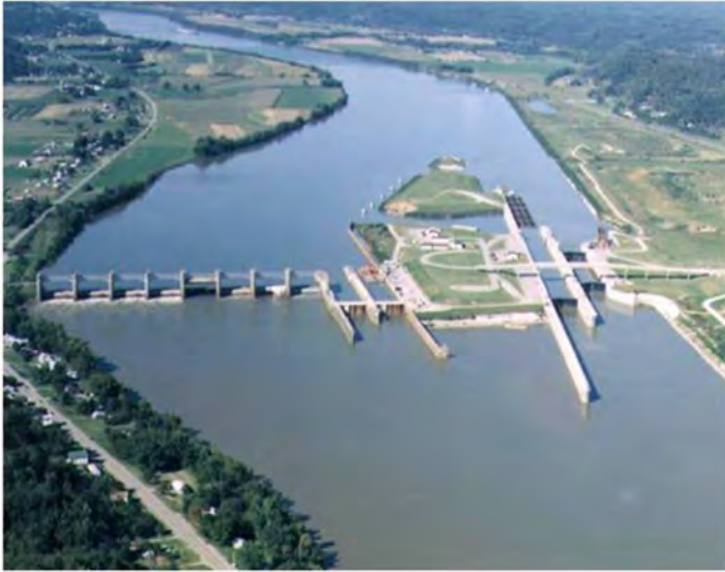
Robert C. Byrd Locks and Dam