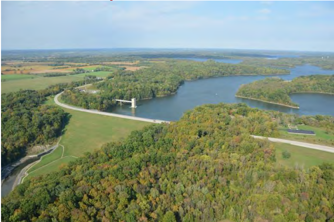
Caesar Creek Lake Dam, OH