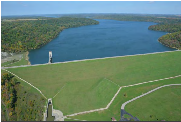
Brookville Dam, IN