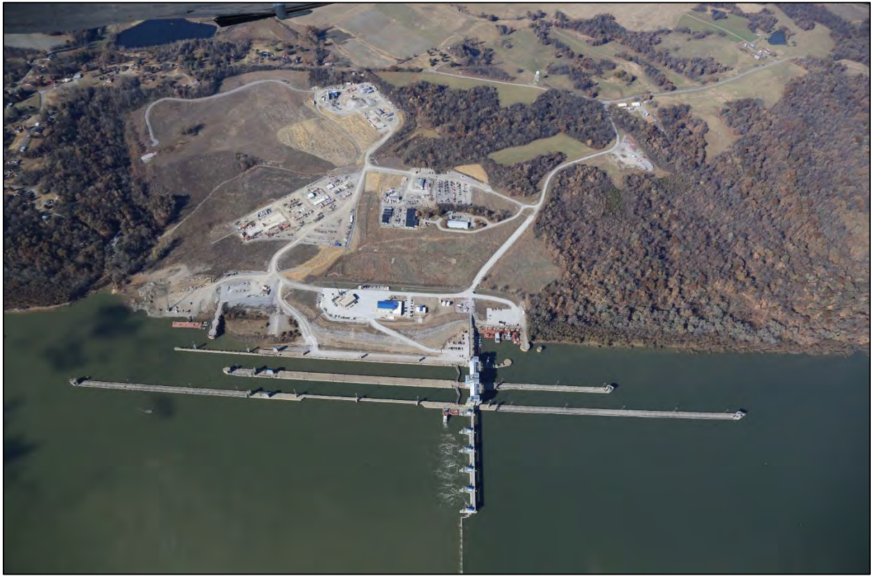
Olmsted Locks and Dam November 2019