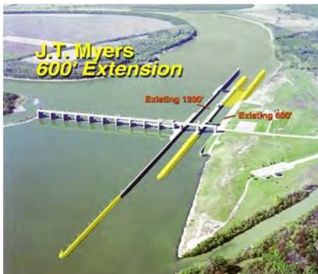
J. T. Myers 600' Lock Extension